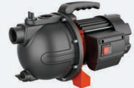
EKJ-1002I / EKJ-1202I