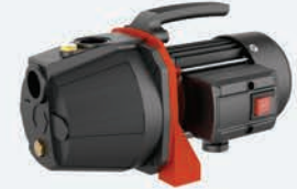
EKJ-602I / EKJ-802I