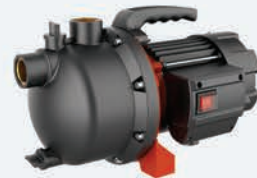
EKJ-1002P / EKJ-1202P