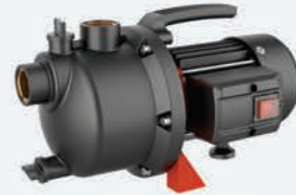
EKJ-602P / EKJ-802P